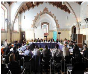
Proceedings of the Mayors for Peace Executive Conference in Granollers