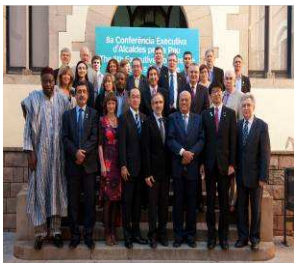
Members of the Mayors for Peace Secretariat at the 8 th Executive Conference, Granollers, Spain.